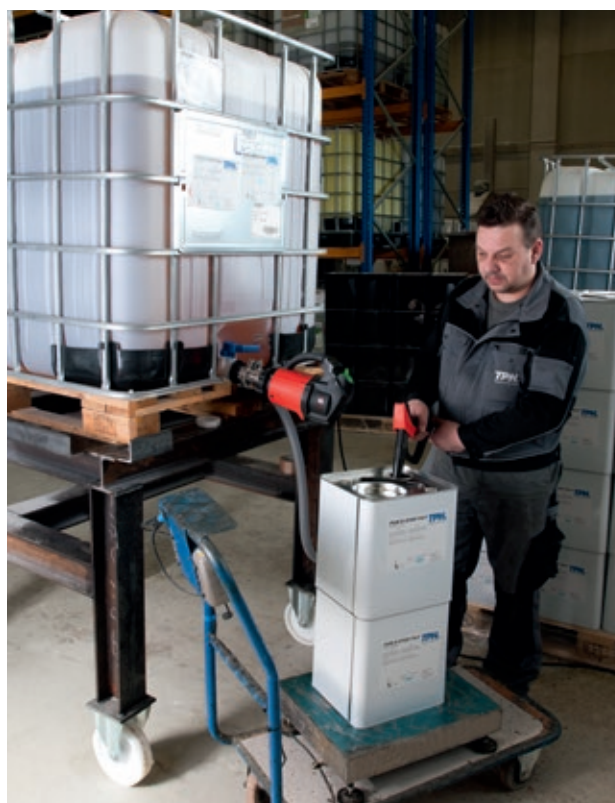
Fast container filling from the IBC outlet.