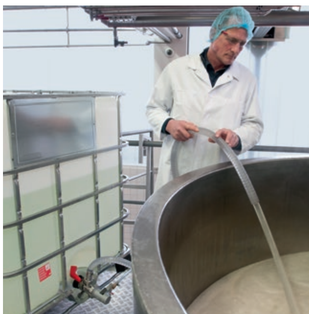
Pumping upward into a mixing container from the IBC outlet.